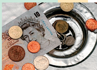
Labour won't throw your money down the drain like the Lib Dems and Tories did