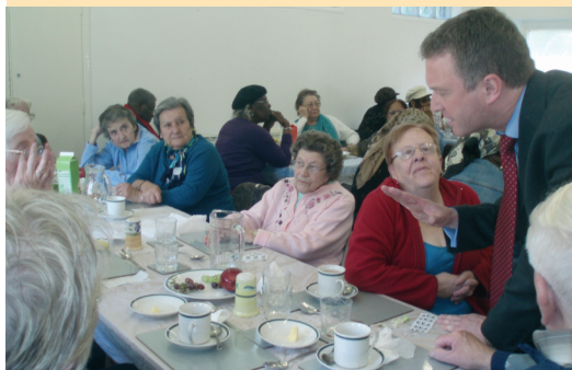
Labour will provide more luncheon clubs to help elderly people to continue to enjoy a healthy and active lifestyle.

We will introduce a new deal for carers who look after older or disabled friends or relatives, offering more support and a well-earned break from their responsibilities.