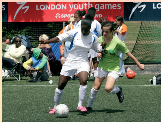
Labour's doubled spending to provide more positive activities for young people.

Young people growing up need help and support to develop positive healthy interests. Under the Lib Dems and Tories Lambeth had the worst-funded youth service in London. That meant young people were left to hang around on the streets where it's all too easy to get into trouble with gangs and anti-social behaviour. Now Labour's doubled spending to provide the biggest ever range of youth activities – and it's led to a dramatic fall in youth crime. Now Labour's pledged to protect that investment and guarantee a range of activities for young people within a mile of every home.