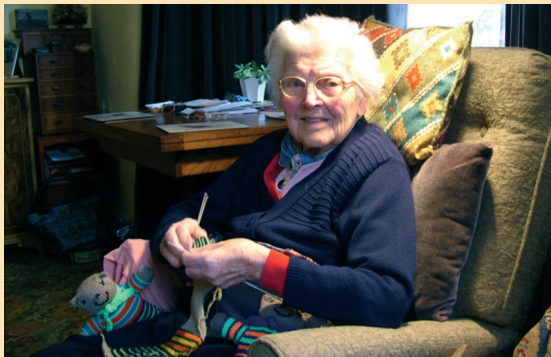
Labour are committed to helping older residents and other vulnerable or disabled people by ensuring high standards in care and safety.

After a lifetime of hard work older people deserve to live their lives in dignity. Labour will make sure the council offers activities to help older people stay fit, healthy and well supported.