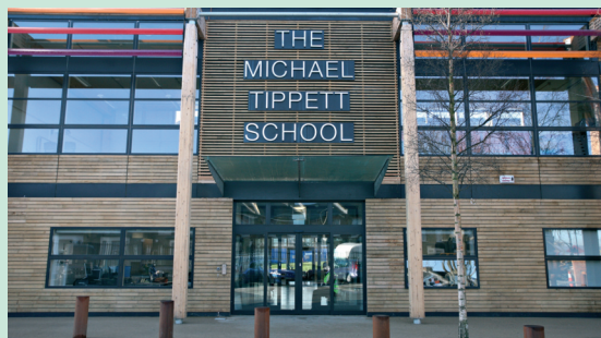
Labour's opened two new secondary schools and won funding for two more primaries.