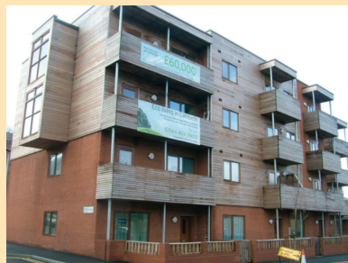
Labour is building more and more eco-friendly sustainable social housing to meet the needs of local residents.

Everyone deserves to live in a decent home