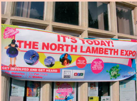
Labour introduced the first Lambeth town-centre expos to encourage local people to take control and make decisions about their own area.