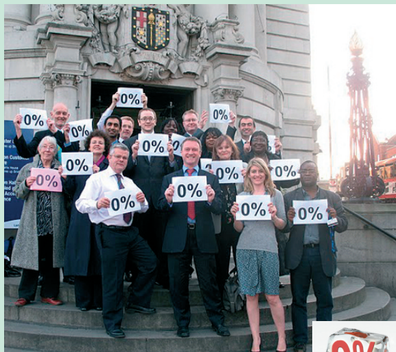
Labour freezes council tax for the second year running.