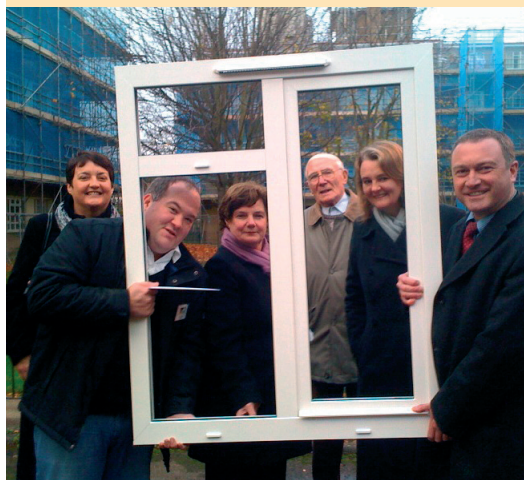
Labour is improving council houses by replacing windows, installing modern bathrooms, kitchens and fitting central heating.

But it's all at risk if the Lib Dems and Tories get their way. They voted AGAINST bringing in the £250 million needed to pay for all the work. That's worth £8000 on average for every council home.