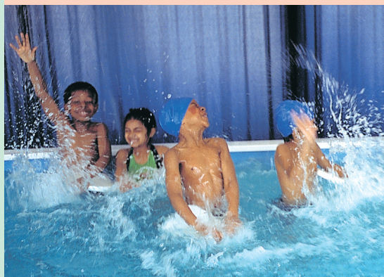
Labour will expand sport and leisure facilities and open four new swimming pools with free swimming for Lambeth residents.